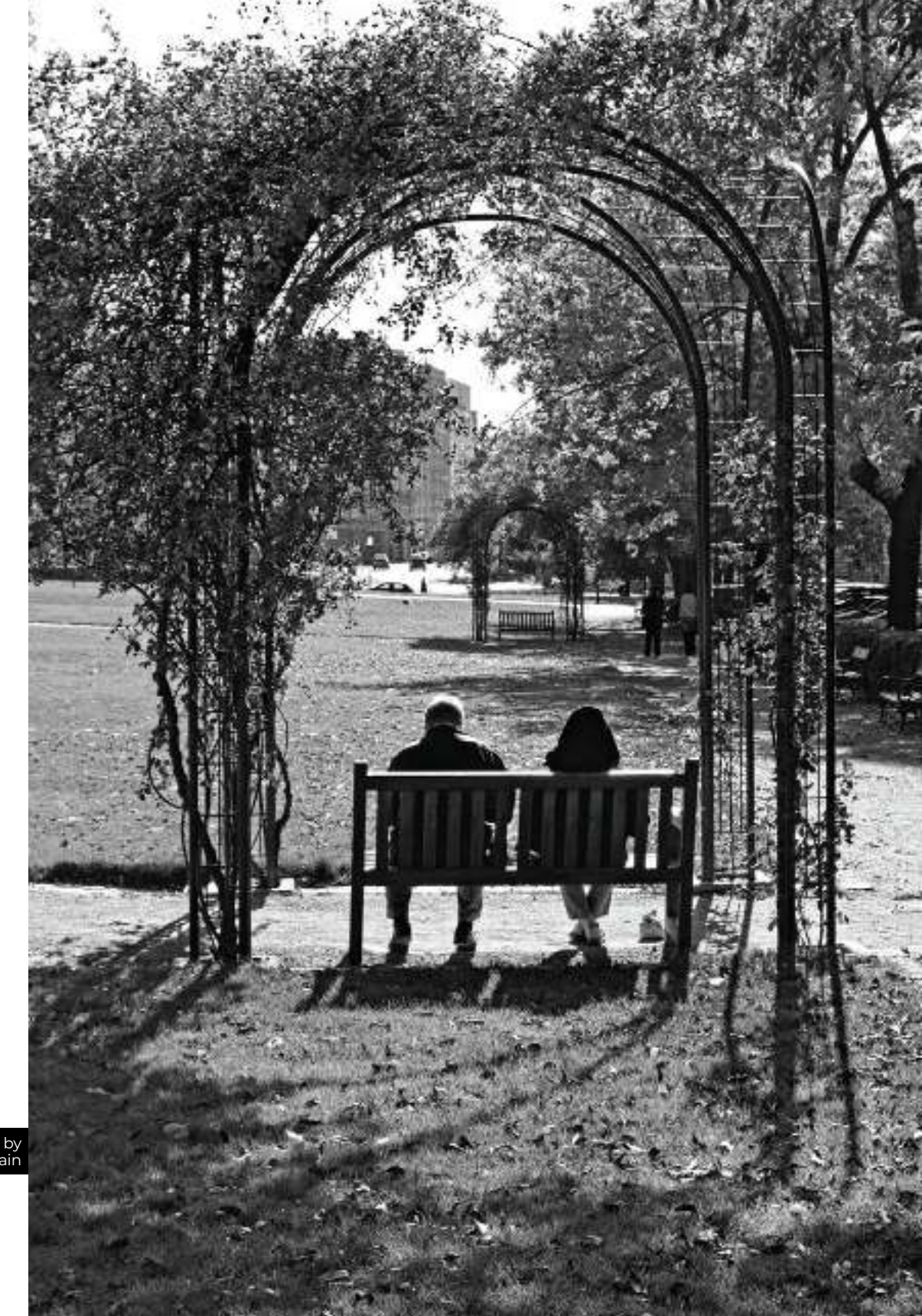
The Bench by Pierre Poulain